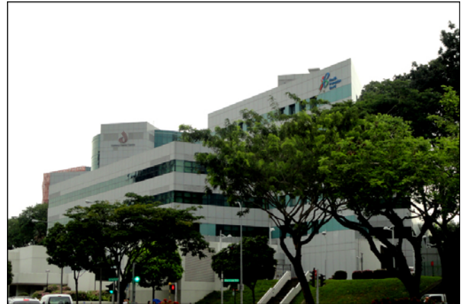
Health Promotion Board: Conference venue

The following speakers from AFSUMB attended the workshop as AFSUMB Faculty: