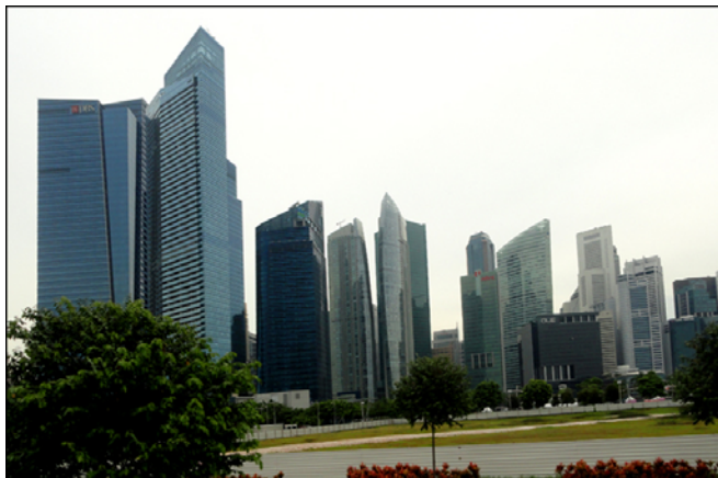
Singapore an important member of AFSUMB

AFSUMB has completed its 11 th Workshop successfully in Singapore on 28 & 29 September 2013, Saturday & Sunday at the Health Promotion Board, Outram Campus, Singapore General Hospital, Singapore