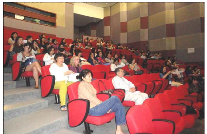
The workshop was well organized and well participated