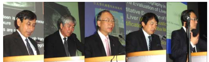
AFSUMB Faculty consisting of five speakers