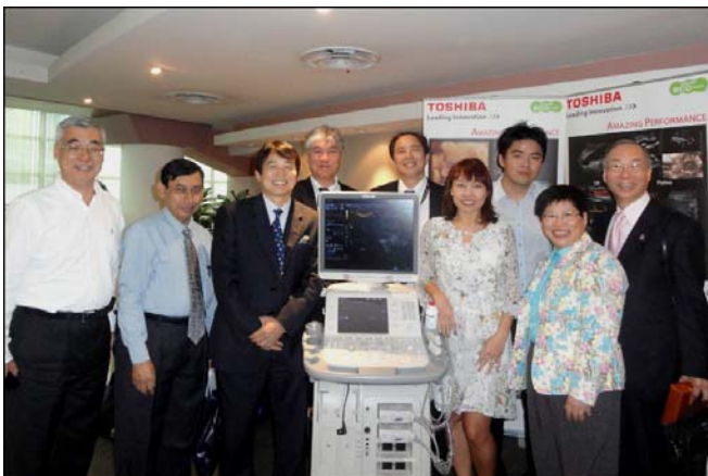
Faculty members are seeing one of products