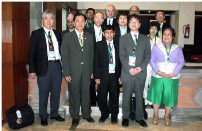
AFSUMB Education Committee meeting in Bali

President and Secretary of the AFSUMB are Ex-officio Members of the EC.